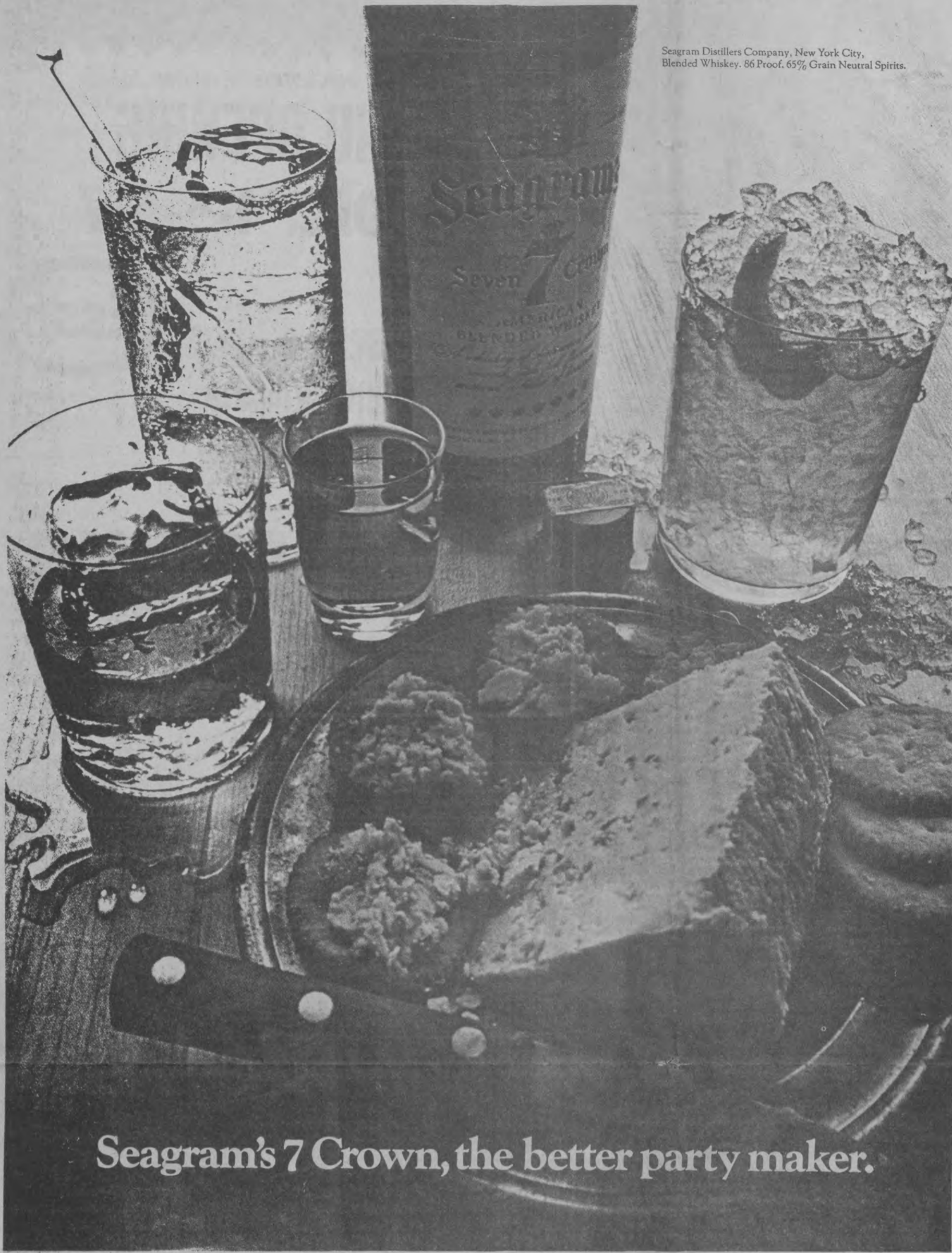
Seagram Distillers Company, New York City, Blended Whiskey, 86 Proof, 65% Grain Neutral Spirits.

Seagram's 7 Crown, the better party maker.