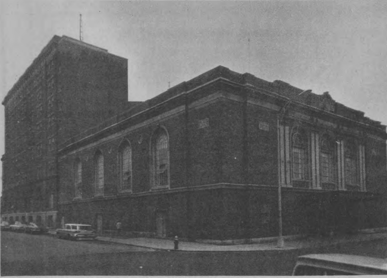
GREATER ROCHESTER SERVICE CENTER- AND FREDERICK DOUGLASS INSTITUTE