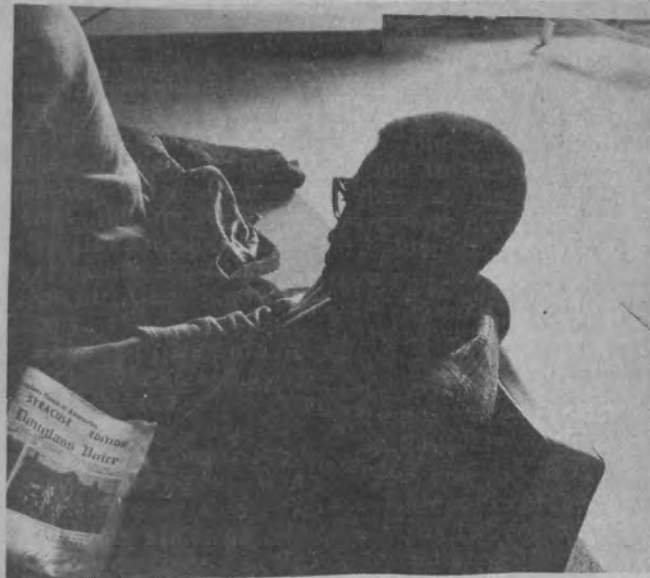
BLACK MILITANTS at U. of R.