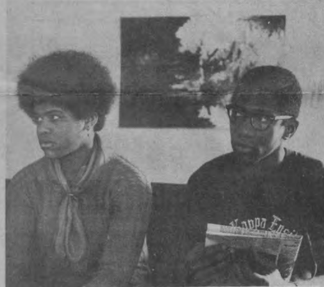
BLACK MILITANTS at U. of R.