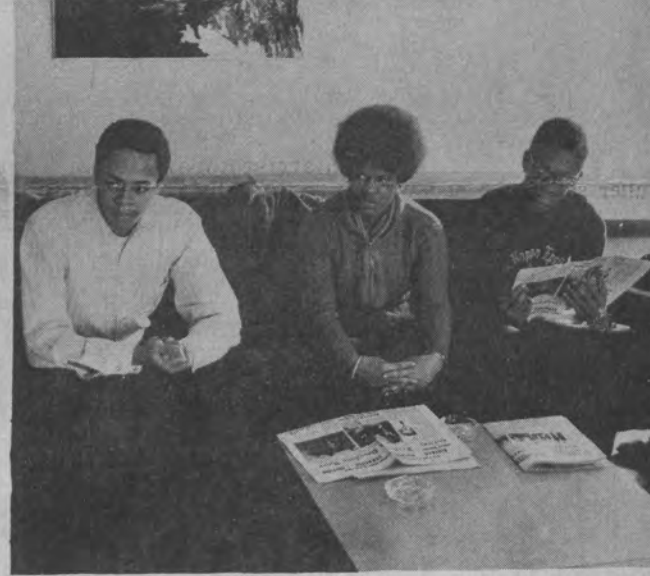
BLACK MILITANTS at U. of R.