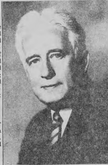
SENATOR KENNETH B. KEATING

For the past eight years he has maintained and trained a composite group of Americans of African descent and Africans performing authentic African dances, songs. Olatunji is working for a doctor of philosophy degree in Public Administration at N.Y. University, plans a career in the Diplomatic Corps.